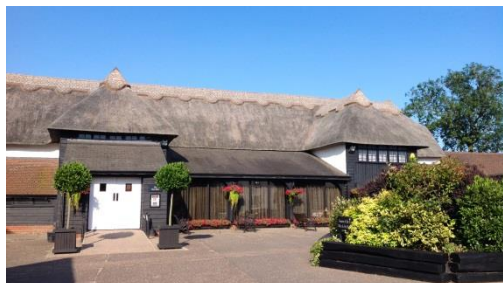
Channels – The Essex Barn

Whether you choose our day delegate package or to tailor make your conference, our professional, experienced and friendly function co-ordinators are happy to discuss your individual requirements and help take some of the stress of organising your conference away.