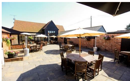
Little Channels – The Courtyard Suite